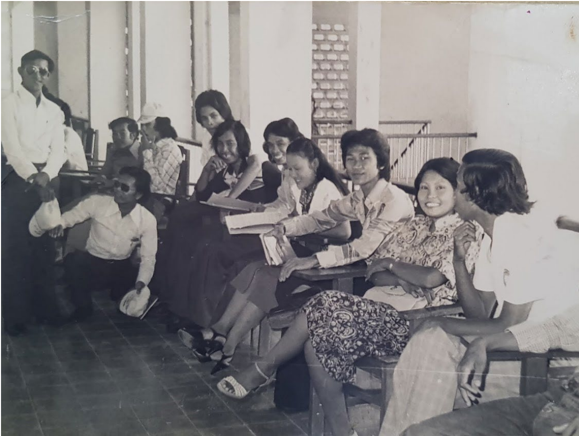
Student journalists and activists at the Islamic State University in Yogyakarta after a campus discussion in the 1970s. During Suharto rule, the hijab was rarely worn in state schools such as this Islamic college.

The 1982 regulation came into effect three years after the 1979 Islamic revolution in Iran as well as the 1979 seizure of the Great Mosque of Mecca, Islam’s holiest site, which helped trigger the rivalry between Iran and Saudi Arabia and fueled debates over the “politics of piety” in the Muslim world, including the place of female Muslim attire. In Indonesia, the increasing number of Muslim clerics who studied in Saudi Arabia and the Middle East advocated for a dress code for women based on Arabian norms, as well as other conservative restrictions on women imposed in the Gulf region. 65