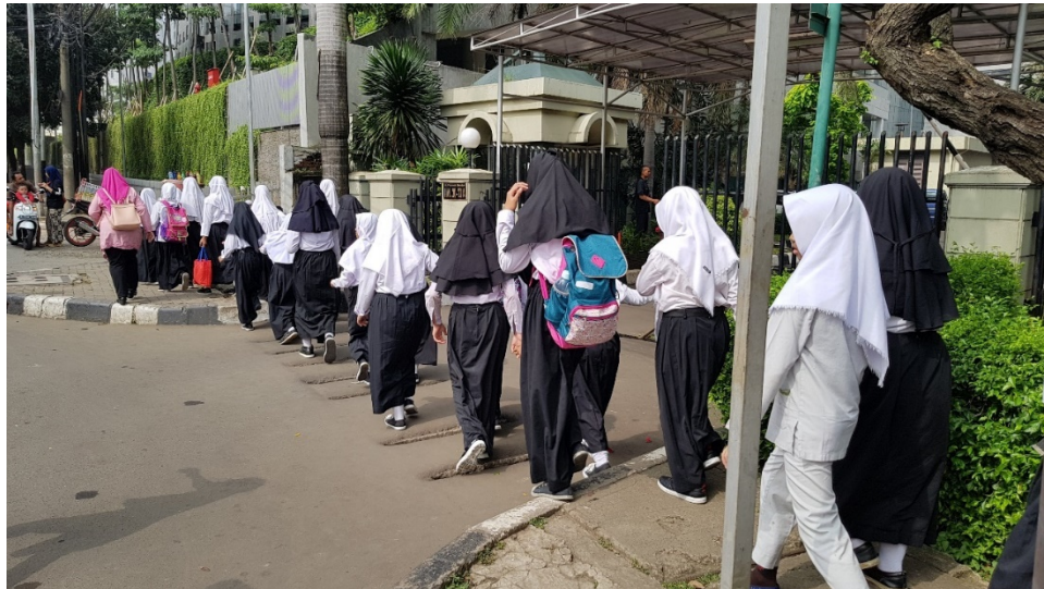
Girls at a primary school in Jakarta on a school outing all wear a jilbab and a long skirts.

I got tired with this jilbab pressure. I feel that the jilbab is being associated with a good woman. The jilbab is being associated with our behavior, our morality. It is not true. I slowly ignored the jilbab requirement. I quit and finished my degree. But I chose not to work in education. I got a job in a private company. It does not have the mandatory jilbab requirement. 176