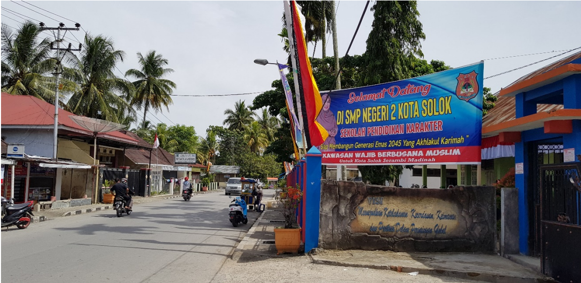
Billboard in front of the gate of SMPN2 school in Solok showing the principal in a long hijab, smiling, with the words “ Selamat Datang di SMPN 2 Kota Solok. Kawasan wajib berbusana Muslim untuk Kota Solok Serambi Madinah ” (Welcome to Public Junior High School 2 Solok City. Mandatory Muslim clothing area for Solok City, Veranda of Medina), August 2018.

She said that her worst experience was wearing the thick and dark Girl Scout jilbab as a young girl at school: “I was crying. Once I got home, I cried and told my mother. I was still in elementary school. I was in third grade. Maybe 9 or 10 years old.” 139