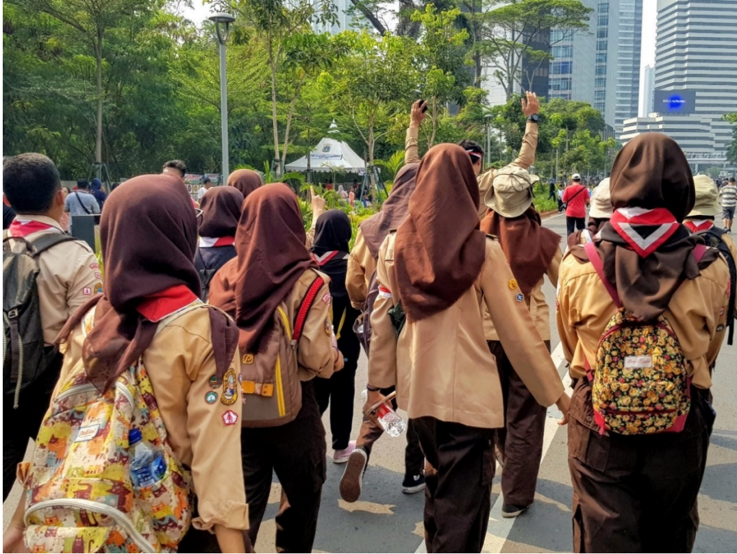
Pramuka (Girl Scouts) wearing the required hijab on their weekly Sunday morning outing in Jakarta. Many schoolgirls complain that the heavy brown uniform makes outdoor activities hot and uncomfortable.

This regulation prompted provincial and local education offices to introduce new rules, which in turn promoted thousands of state schools, from primary to high schools, to rewrite their school uniform policies to require the jilbab for Muslim girls, especially in Muslim-majority areas. In such schools, Muslim girls are required to wear a jilbab as well as long-sleeve shirts and long skirts. 95