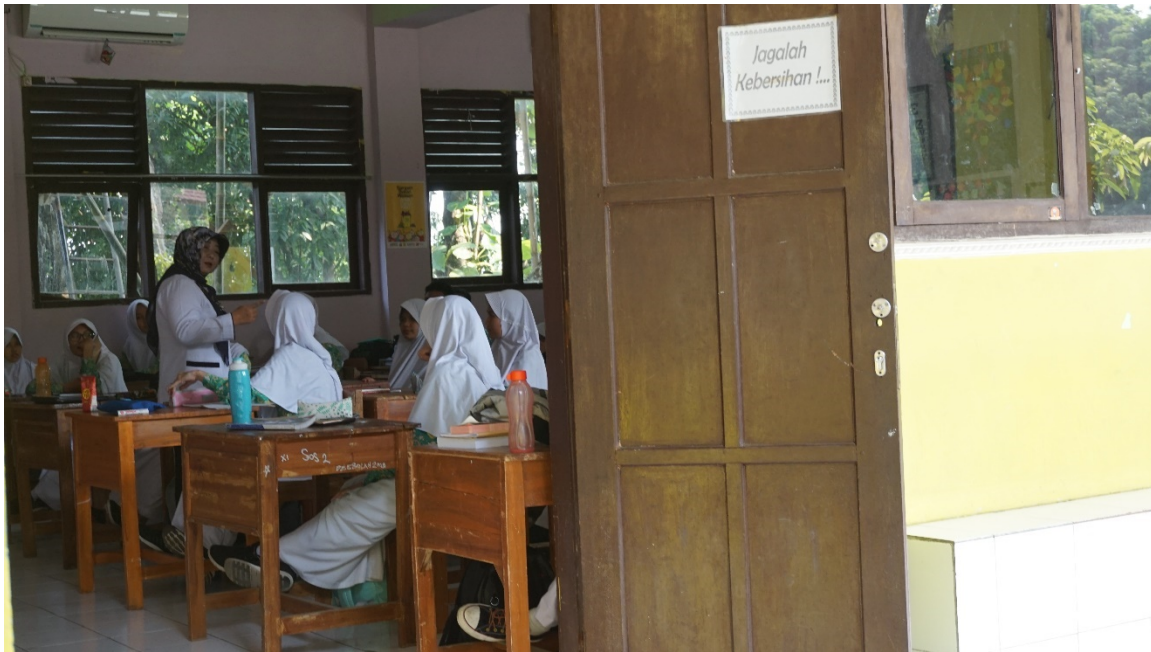
A teacher and students at SMAN2 public high school in Cibinong, Bogor.