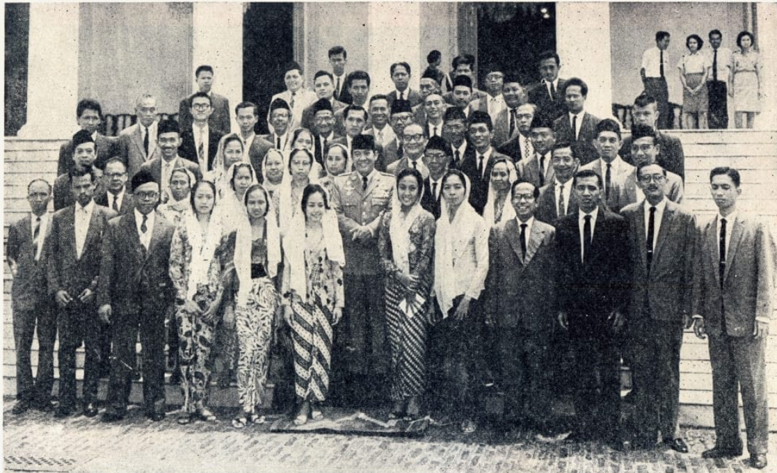
Upatjara telah selesai, diabadikan dimuka istana.

Muhammadiyah leaders present President Sukarno in the State Palace in Jakarta with a medal called the Muhammadiyah Star, April 10, 1965.